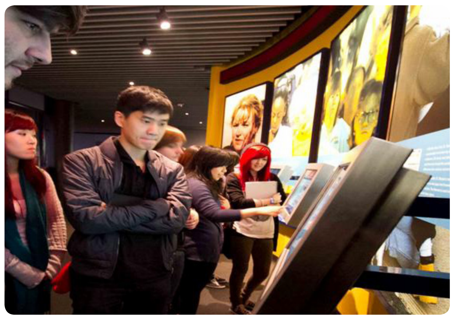
Students viewing Confronting Hate in America and GlobalHate.com exhibits at the Museum of Tolerance