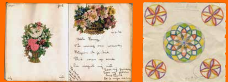
Anne artifacts include: (L) Autograph book (R) Anne's artwork

Also in the Museum of Tolerance is the recreation of famed Nazi hunter Simon Wiesenthal's Vienna office where, proudly displayed on Mr. Wiesenthal's desk, is the newspaper article detailing the arrest of Karl Silberbauer, the Nazi that arrested Anne Frank and who Mr. Wiesenthal brought to justice many years ago.